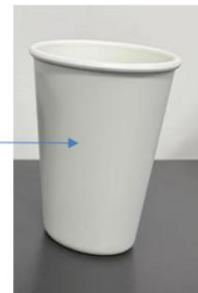
1 : direct food contact

The following substances subject to restrictions and/or specification are used in the above-mentioned product. The materials and raw materials used comply with Regulation (EU) No 10/2011.